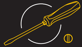
Slotted Screwdriver OR SAE Hex Wrenches