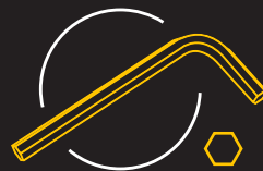
5/32" Hex Wrench