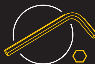
Flat head or hex key to remove pistol grip