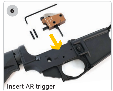
Insert AR trigger