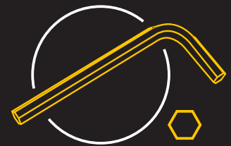
Flat head or hex key to remove pistol grip