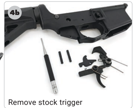
Remove stock trigger